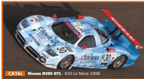
CA14c Nissan R390 GT1 - #30 Le Mans 1998