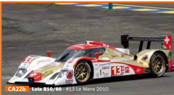
CA22b Lola B10/60 - #13 Le Mans 2010