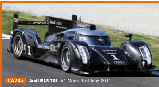
CA24a Audi R18 TDI - #1 Monza test May 2011