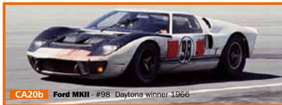
CA20b Ford MKII - #98 Daytona winner 1966