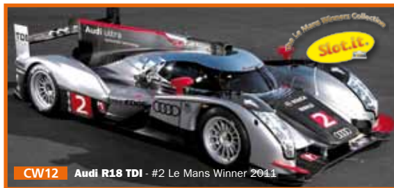
CW12 Audi R18 TDI - #2 Le Mans Winner 2011