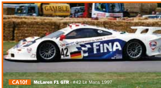
CA10f McLaren F1 GTR - #42 Le Mans 1997