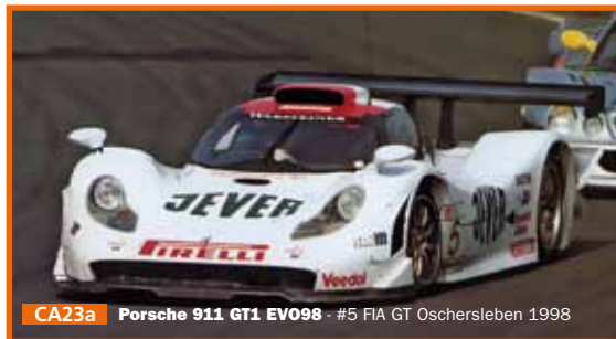
CA23a Porsche 911 GT1 EV098 - #5 FIA GT Oschersleben 1998